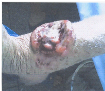
Figure 2: Clinical photograph of malignant melanoma in an albino.