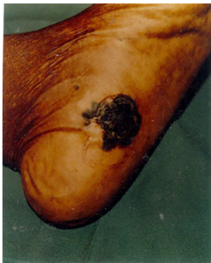
Figure 1: Clinical photograph of plantar melanoma.

Diagnosis was made by histology, which revealed 15 melanotic lesions described on the darkly pigmented while the albino had amelanotic melanoma, Figure 3. Fifteen patients had excision while 3 patients who presented with regional lymphadenopathy had in addition adjuvant chemotherapy (methotrexate, cisplatin). There was a fatal outcome in a patient who presented with a fungating right foot