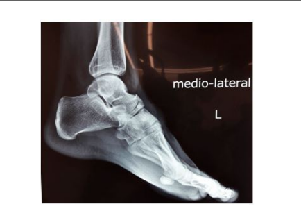
Figure 1: Pre-operative X-Ray lateral view of foot and ankle showing fracture dislocation of navicular bone.

At 2 weeks postoperative follow-up, patient looked well, and wounds were clean, and the clips removed. He could then wash his foot and commence range of motion exercises. He was then allowed partial weight bearing with his boot on, touch weight bearing on the toes. He was advised to keep it elevated. He could remove the boot for washing, sleeping, and range of motion exercises. 8 weeks post-surgery, he was doing well. He still had marked swelling and some stiffness, but he was comfortable, he could take weight on his foot as his X-ray was satisfactory. He was allowed take weight and transition from his CAM boot to work boots over the next four weeks. He was also advised to swim, cycle and walk around the house. His follow-ups were scheduled for 4 weeks. At 12 weeks follow-up, the patient had returned to work and resumed his everyday activities. Till date, at 24 weeks post-surgery no complications have been noticed or recorded and patient is doing well and back to cycling (Figures 1 to 5).