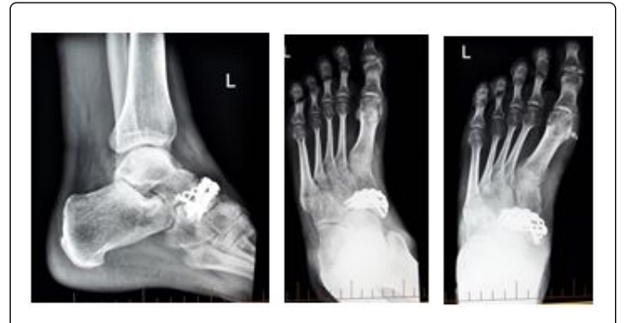
Figure 5: 12 weeks postoperative AP and lateral views.