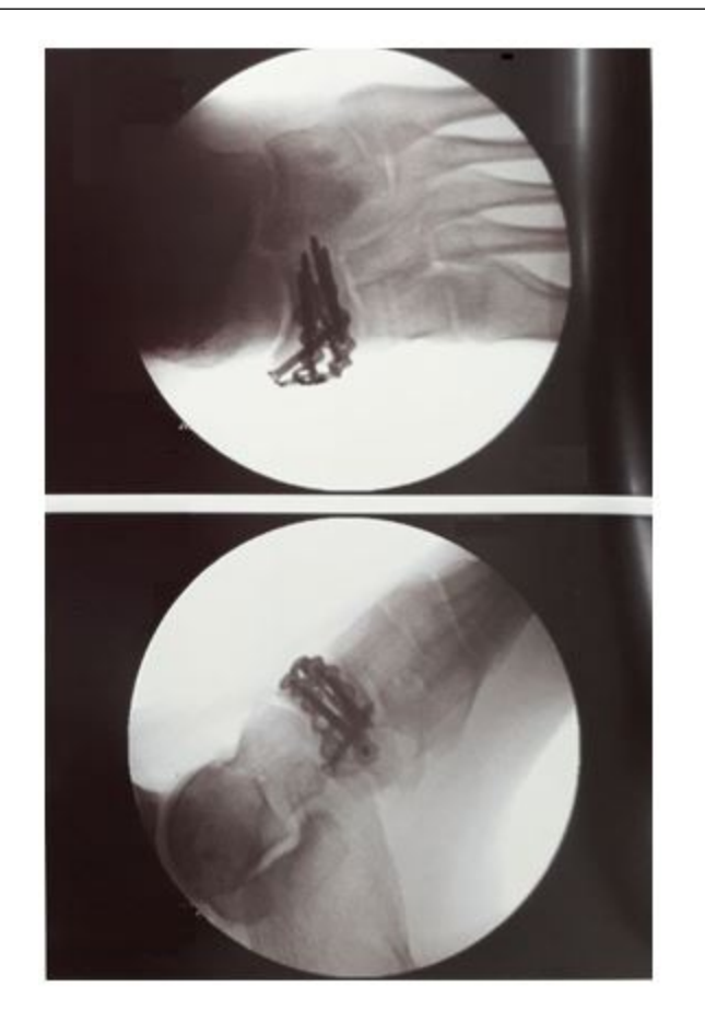
Figure 3: Postoperative AP and lateral views.