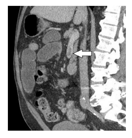
Figure 2: Arrow shows non occluding thrombus in superior mesenteric vein.