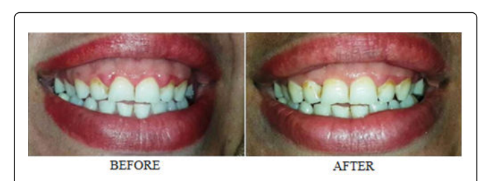
Figure 5: The forth patient before and one-month after surgery.