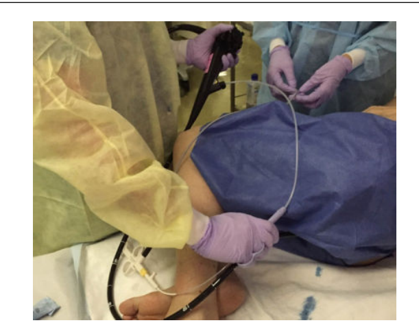
Figure 3: Colorectal ESD using Smart Shooter*.

The fourth and fifth fingers of the operator's right hand are inserted into the two rings of the controller part to grip the controller part along with the endoscope (Figure 3).