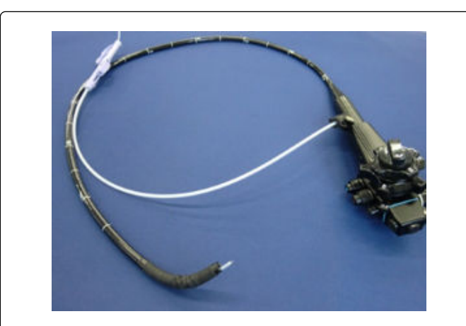
Figure 2: Smart Shooter<sup>®</sup> with a treatment device attached is inserted into an endoscope.

The fourth and fifth fingers of the operator's right hand are inserted into the two rings of the controller part to grip the controller part along with the endoscope (Figure 3).