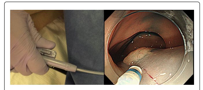
Figure 4: Use of the Smart Shooter<sup>®</sup> during protrusion of the ESD knife.

group), with respect to various treatment-related factors, including en bloc resection rate, negative margin rate, perforation rate, muscle layer damage rate, procedure time, dissection speed, postoperative fever of \geq 38°C, and adherence to the clinical path.