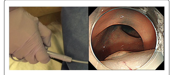
Figure 5: Use of the Smart Shooter<sup>®</sup> during reception of the ESD knife.

The procedure time was defined as the interval from the start of incision to completion of specimen excision. The dissection speed was calculated as the resected area (long radius of the resected specimen \times short radius of the resected specimen \times 3.14) divided by the procedure time.