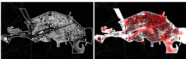
Figure 4: Morphological features through Key Categories: Porosity emerges when Volume and Void layers are superimposed (Left), Proximity is the integration of Function and Void layers (Right).

Despite GDP growth by roughly 50 percent in real terms over the last decade [18], about 20 per cent of Rio's population live in informal settlements known as Favelas. These slum areas have very limited access to public services and amenities. Electricity distribution is perhaps an exception, but often informally accessed [14].