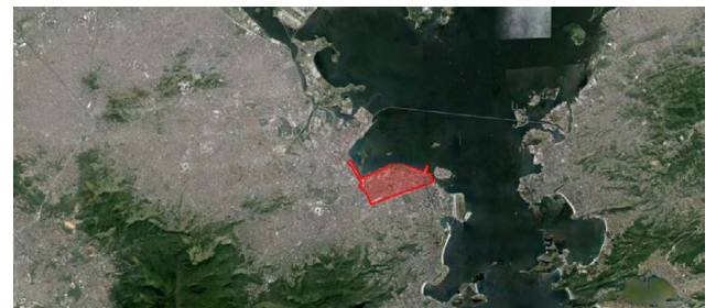
Figure 1: Transformation of Rio's neglected port of Maravilha is one of the hideous areas in the city surrounded by .

application of IMM process to a selected area in the city of Rio de Janeiro, Brazil, named Porto Maravilha (Figure 1). It addresses the application of the IMM methodology to the selected case study. As IMM is a multi-stage process, the entire framework is not depicted in this paper. Rather, the case study mainly focuses on application of the second and third phases of the IMM method. In particular, highlights of the results achieved by the two phases, named Investigation and Formulation, are presented here. These phases are respectively dedicated to investigate the actual morphological configuration and