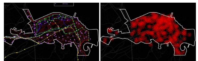
Figure 3: Volume, Void, Function, and Transportation are the four basic layers. Shown are the Porto Maravilha Transportation Layer (Left) and Function Layer (Right).

Proximity denotes the easiness of reaching to urban main activities by means of non-motorized traffic. Its concept is driven from superimposition of Volume and Functional layers and it indicates the distribution pattern of urban key functions [9].