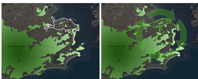
Figure 2: Transformation of a member of a system locally (Porto Maravilha) affects the entire system (Rio De Janeiro) globally.

According to IMM, the city is considered as a CAS, and for