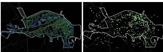
Figure 5: Typological map through Key Categories, Interface (Left) and Diversity (Right).