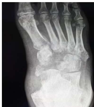
Figure 1: X-ray before surgery showing metastases in the right foot and ankle.

intramedullary nail. A heterologous collagen membrane was used as a cover over the bone xenograft and the osteosynthetic material to facilitate and accelerate the physiological regeneration process (Figure 1).