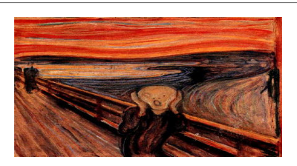
Figure 4: The Scream.

The painting portrays an acute sensation (Figure 4). The individual closes his ears to avoid hearing the fearful screams coming from within; he is alone, isolated, with other individuals way behind, not in his world.