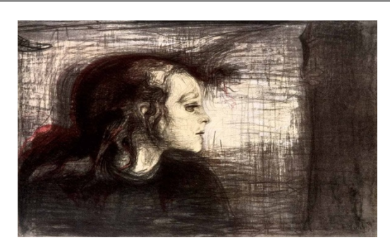
Figure 8: The Sick Child.