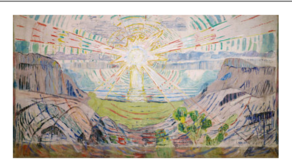
Figure 9: The Sun.

In this painting (Figure 9), the sunrays are the water of the ocean, light green and blue, happy, vivid formations; it is a vivid expression of optimism. The sun is shining from heaven, reaching out to all infinity [8]. There is perhaps an element of religious faith that beyond the horizon there is to be found the rhyme and reason of life.