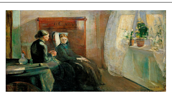
Figure 6: Spring.

S:...I am in bed like a couch potato, sleeping, eating and complaining continuously; my stomach is hurting, nothing to talk about. End.