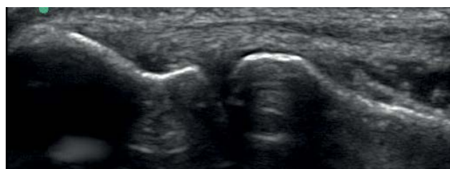
Figure 2: Right radial head with area of hypoechoic signal changes within the tendon.