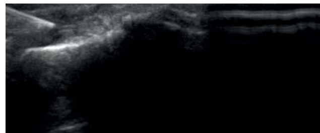
Figure 4: Injection of AmnioFix directly into focal area of hypoechoic signal change.