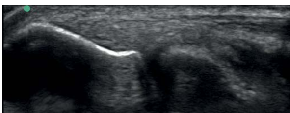
Figure 3: Right lateral epicondyle with significant thickening of the tendon.