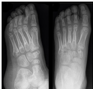
Figure 3: Final X-ray after 4 weeks.