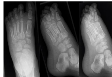
Figure 1: X-ray at admission.

operation. In addition, immobilisation with short non-walking leg cast was achieved.