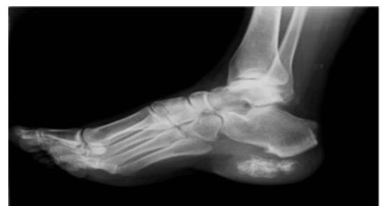
Figure 2: Soft tissue mass nearby calcaneus at the plantar face of foot with central ossification areas and does not reach cortical space.