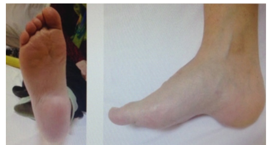
Figure 1: Nodule located at heel, localized swelling, cavus of foot.

There is couple theories for development of heel pad osteochondromas, some researchers come up with idea that it might