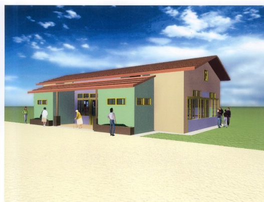
Figure 5: External view of the protected housing for in dependent elderly.