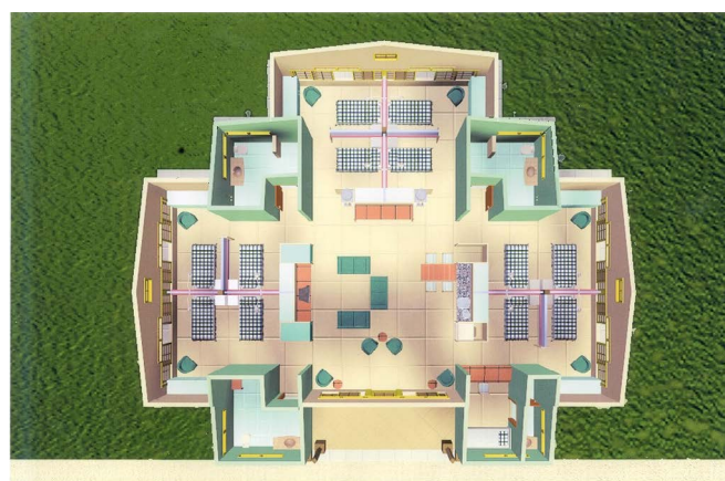
Figure 6: Internal view of the protected housing for in dependent elderly.

this type of housing was also foreseen to be implemented in other districts of the city of Rio de Janeiro, which present a significant elderly population, and articulated with the Primary Health Care Units, such as Health Centres Medical Stations.