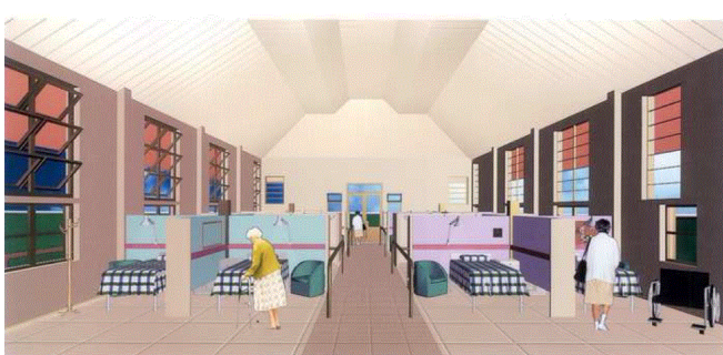
Figure 3: Internal view of the pavilion of the protected housing for semi-dependents and dependent elderly.