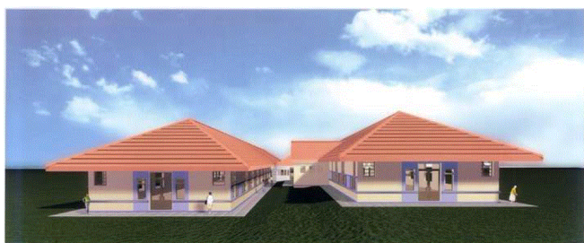
Figure 2: External view of the pavilion of protected housing for semi-dependents and dependent elderly.