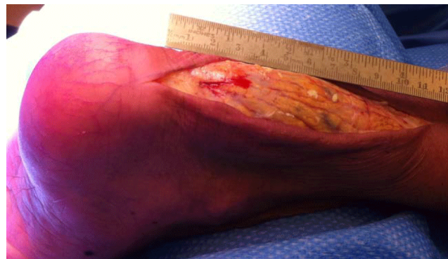
Figure 2a: The tumor of the left Achilles tendon exposed.

helpful in diagnosing FH [8]. Moreover, it may also be helpful in preventing cardiovascular disease as several authors suggested that xanthomas are associated with a high risk for cardiovascular disease in patients with FH [4,9]. This is supported by a review of Fahey et al in which the authors showed that a majority of patients with Achilles tendon xanthomas had a family history of coronary disease [3].