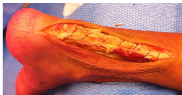
Figure 2b: After resection approximately 50% of the tendon was intact.

We decided to perform a tendon sparing resection of the xanthomas. However macroscopically both tumors were excised in total, its infiltration into the tendon made a subtotal resection inevitable. Carranza-Bencano et al. stated, in case of severe xanthomas infiltration, total resection is the best surgical technique [1] to avoid the risk of recurrence. As summarized by Huang et al. there are several procedures for Achilles tendon reconstruction. Autogeneous tendon grafts such as the peroneus brevis or flexor hallucis longus (FHL) are commonly used. The authors described a reconstruction with a tibialis posterior autograft, which was necessarily because of a large tendon defect after extensive resection [5]. We also performed an extensive resection resulting in a partial tendon defect, but decided to qualify the procedure as 'tendon sparing' (without reconstruction) when at least fifty percent of the cross-section tendon was saved. We believe this technique is a less invasive procedure, especially because other tendons (FHL, tibialis posterior and peroneus brevis tendon) and their functions remain intact, resulting in faster recovery. The patient started weight bearing after two weeks where others reported non-weight bearing periods of six weeks [3] or almost nine weeks [5].