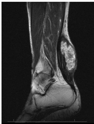
Figure 1a: Sagittal MRI view of the xanthoma in the right Achilles tendon.

muscle was resected. The wound was closed in layers. See figure 2 for photographs of the procedure and the clinical end result.