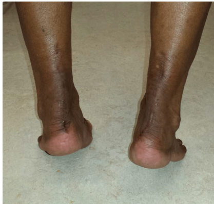
Figure 2c: Clinical result after 18 months. The patient is able to perform a heel raise.

Moreover, a subtotal tendon resection is associated with fewer complications compared to total excision with reconstruction [10]. For example, reconstruction of the Achilles tendon with the FHL tendon may lead to impaired flexion at the hallux interphalangeal joint and first metatarsophalangeal joint [3].