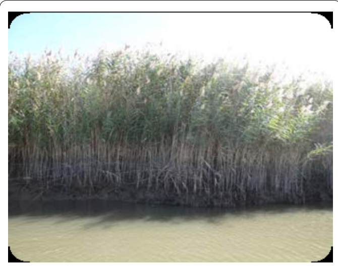
Figure 2a: Dense monoculture of dead and living non-native Phragmites australis within Blackbird Creek. If left unmanaged, vast stretches of wetlands may become engulfed by this highly productive, genetically diverse, and hard to control subspecies, potentially resulting in the displacement of countless numbers of native ecologically and commercially important flora and fauna in the process.

The physical and mechanical methods for controlling Phragmites include the removal of dikes, the construction of controlled wetlands, raising the water table, modification of micro-topography [25-26],