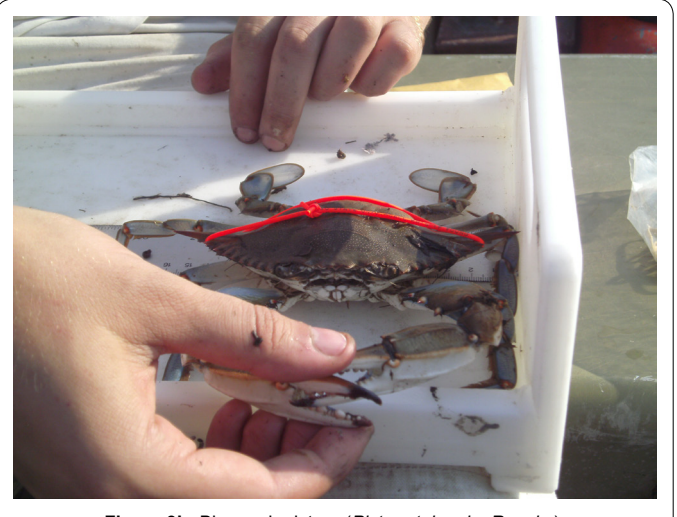
Figure 3b: Blue crab picture.

monitor the health of an environment or ecosystem. The microbial distribution of these microbes in soil, roots, and leaves has been monitored and related to the physical and nutrient components of samples from different seasons in order to understand their effect on microbial distribution relative to plant growth and distribution since microbes are influenced strongly by plant phenology. Specific molecular analysis for Proteobacteria testing has been performed spatially and temporally to identify and compare microbial communities associated with two dominant marsh grasses (Phragmites australis and Spartina alterniflora). Vesicular arbuscular mycorrhizae (VAM) are fungi that effectively increase the nutrient availability to the host plants. Microscopic and molecular analysis of plant roots was carried out for the detection of the fungi and a seasonal study was conducted to determine their presence and abundance during the growing season and the death phase. Diatom population dynamics were determined by genetic analysis in order to infer seasonal and spatial water quality trends.