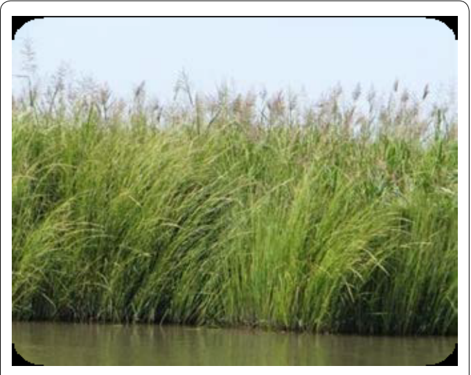
Figure 2b: Natural marsh absent of non-native Phragmites australis. Spartina alterniflora and Spartina cynosuroides are observed among several other typical native marsh plants and in most cases both plant and animal diversity is greater than in a marsh that is considered to be undergoing a late stage of non-native Phragmites invasion.