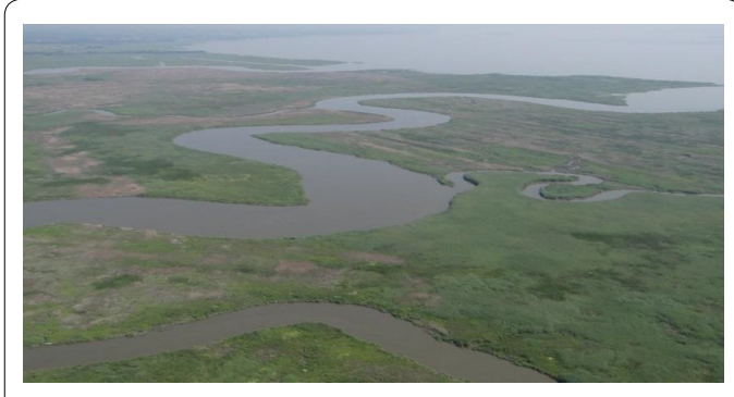
Figure 1a: Aerial photo of Blackbird Creek. ( Figure taken from Roeske 2014 ).

Healthy populations of submerged aquatic vegetation (SAV) and structured bottoms are two features which are severely lacking throughout the Delaware estuary [18]. The subtidal environment of Blackbird Creek can be described as muddy and unstructured, forcing juvenile crabs and fish to seek out other suitable refuge and nursery-providing habitat. Thus, they generally benefit from the relatively shallow streams and creeks with accessible intertidal zones that, in their native form, consist of a mosaic of marsh vegetation which provides structure in comparison to the otherwise unstructured subtidal