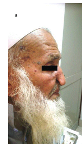
Figure 1a: Swelling and redness on right side of nose and nasolabial fold.

smears were obtained from swelling involving right side of nose and nasolabial fold. Air dried and wet, alcohol fixed, slides were prepared.