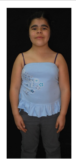
Figure 5: Younger sister: Extraoral photograph.

The patient was short statured, narrow chest and sloping shoulders, brachycephalic, with frontal bossing, mid-face hypoplasia, moderate telecanthus and wide nasal bridge and base. Oral findings include mixed dentition, Class III malocclusion with anterior and posterior cross bite and delayed eruption of permanent teeth (two years late in comparison to national standards) (Figure 6). Radiographic findings (Figures 7 and 8) were five supernumerary teeth, three on the upper jaw and two in the mandible. Lateral cephalograph revealed skeletal class III values. Thorax radiographs showed presence of clavicles, but a cone shaped thorax with narrow upper thoracic diameter (Figure 9).