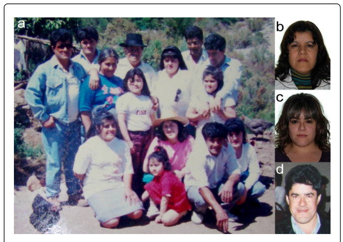
Figure 10: a) Family group b) Mother c) Cousin d) Uncle.

In these two particular cases, we found specific physical and oral findings in common, what suggest the idea of a familial disease or a syndrome. Furthermore, the physical aspects were similar in the rest of the family group (Figure 10).