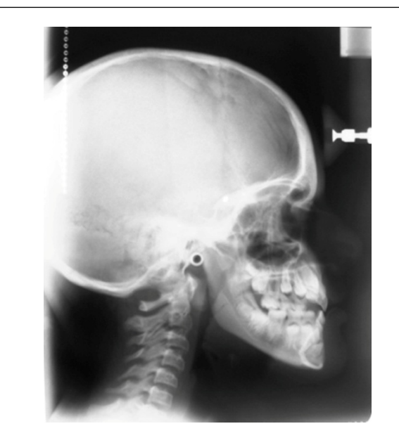
Figure 4: Older sister: Lateral cephalometric radiograph.

The 8 years old girl (Figure 5) was referred to our department with the chief complaint of delayed eruption of permanent dentition. She had expressed some secondary sexual characters and, because of her short stature, she was under medical treatment in order to prevent early puberty.