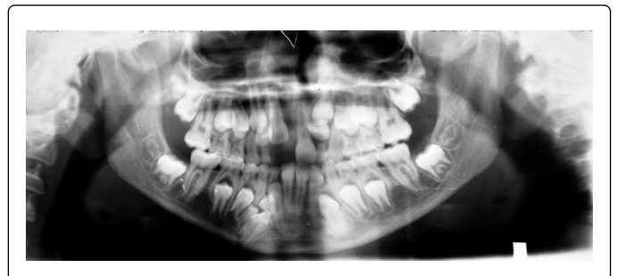
Figure 3: Older sister: Panoramic radiograph.

Figure 2: Older sister: Intraoral photographs.