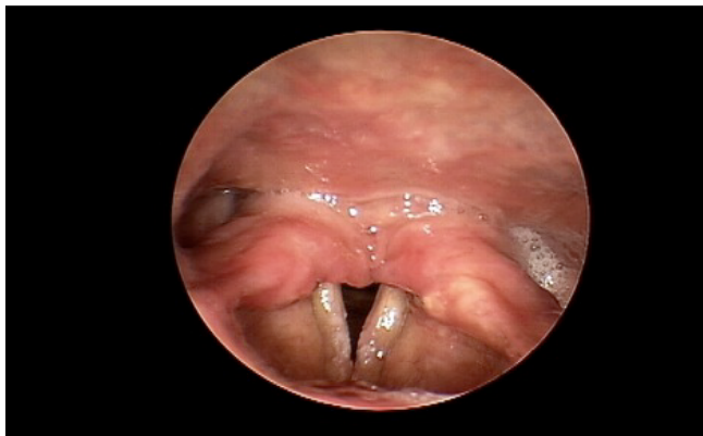
Figure 3: Post-operative picture from second surgery.

that closely mimic those observed in children with congenital LM. In individuals with acquired LM, breathing difficulties are most often experienced during exertional activities and delta sleep stages 3 and 4. In cases like this, flexible nasolaryngoscopy during sleep has demonstrated invagination or obstructive prolapse of the arytenoid bodies toward the laryngeal lumen during inspiration [2]. When these signs are observed, they may be considered causally related to associated stridor, intermittent hypoxia, hypercapnia, and hypopnea.