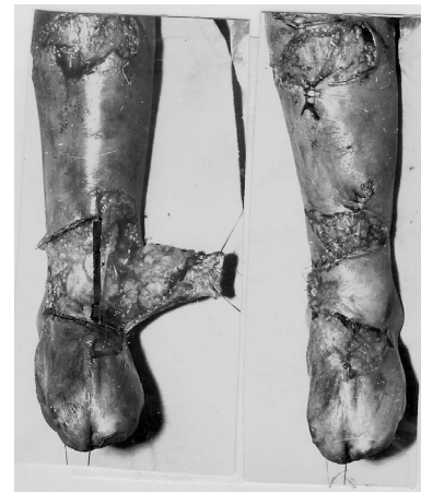
Figure 4: Left ankle: operation details are the same as right ankle.

With the first incision along the fold's crest, the sheets were separated. The following Y-shaped incision dissected the scar sheet to the malleolus (scars and subcutaneous fat layer). After full ankle extension, a large trapezoid wound was formed (Figures 3 and 4, left, medially of dark strip). According to the wound's form, the big trapezoid flap was mobilized including full subcutaneous fat layer (Figures 3 and 4, left). The end of the flap was 4 cm wide; the flap's length was about 5-6 cm. The flap's end included part of the fold's crest, the flap's base located ahead the contralateral malleolus. The flap was transposed on the wound with moderate tension and connected with the wound's edge near malleolus (Figures 3 and 4, right). As a result, the ankle lateral surface was covered with healthy adipose-cutaneous layer (Figures 3 and 4, right). Due to severe scar surface deficiency, the wound edges divergence was more significant than in cases of mild and moderate contractures; therefore, the scar sheet was impossible to use for donor wounds' coverage located aside the flap which was skin grafted. The scheme of the operation is shown in Figure 5. Simultaneously ulcerous scars over patella and upper legs were excised and the wound was covered with neighboring tissue displacement and skin grafts (Figure 6).