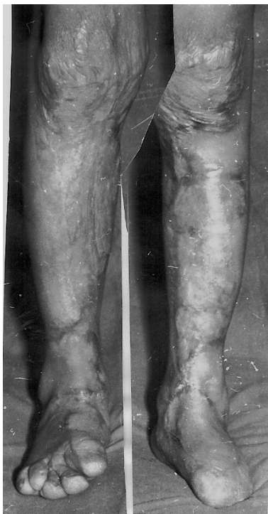
Figure 7: Result (one year after operation): contracture eliminated in full, good aesthetic appearance.