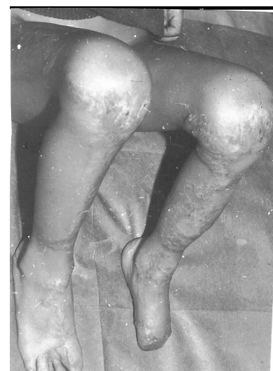
Figure 9: Knee joints' flexion restored.