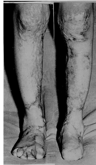
Figure 8: Three years after surgery: normal lower extremities development, good functional and Aesthetic result.

that covered upper legs and knee anterior surfaces were also alive. Skin transplants on the feet and legs well grew with wound tissue (Figure 6). No serious postoperative complication occurred. Follow-up observation: one and three years after surgery (Figures 7 and 8); function and contours of the ankle and knee (Figure 9); joints restored, contracture released completely. Due to contracture elimination, the legs and feet developed well and increased in size. Flaps continued to grow parallel with legs and ankle, preventing contracture recurrence. Skin transplants converted in the well-functioning skin, continued to grow without signs of shrinkage. The function of lower extremities was restored, and their appearance also significantly improved due to surgical treatment of concomitant contractures and deformities.