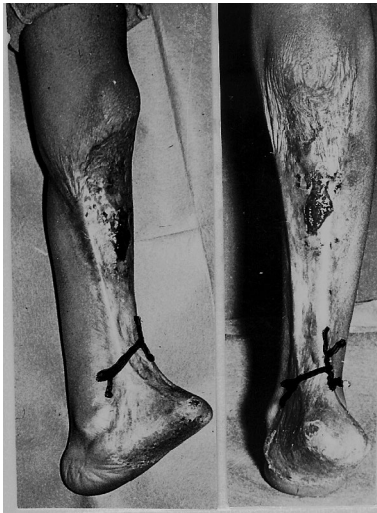
Figure 2: Left ankle edge contracture, anatomy contracture and planning is similar as of right ankle; in both cases: multiple contractures and tissue defects: ulcerous scars over patellae and legs' anterior surfaces.