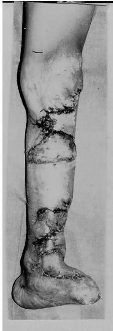
Figure 6: Reconstruction of knee and upper legs' surfaces by ulcerous scars excision and wounds resurfacing with descending adipose-skin thigh layer and skin grafts; ten days after reconstruction; flaps and skin grafts alive, ankle contracture eliminated.