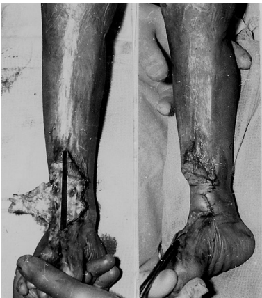
Figure 3: Right ankle reconstruction: left-contracted scars separated from healthy skin by incision along fold's crest; scar sheet dissected by Y-shaped incision; trapezoid flap mobilized; ankle extended, and trapezoid wound appeared (right from dark strip); right-flap transposed on the wound and formed ankle flexion surface; aside the flap wounds will be skin grafted;

The scar sheet surface deficiency in length (reason for contracture) must be determined since reconstruction is aimed to compensate the deficiency with an adequate flap. The form and size of scar surface deficiency is estimated using the following steps (Figures 3 and 4, left): the sheets are divided with an incision along the fold's crest; with Y-shaped perpendicular incision the scar sheet is dissected from the fold's crest to the malleolus where the incision is split under 45 degrees (Figures 1 and 2). After ankle dorsiflexion, a trapezoid wound, as a rule, appeared, reflecting the form and size of scar surface deficiency which was maximal at the fold's crest and spread, subsiding, to the malleolus (Figures 3 and 4, left, medially from dark strip). It was obvious that a similar (trapezoid) flap was needed for deficiency compensation and contracture elimination.