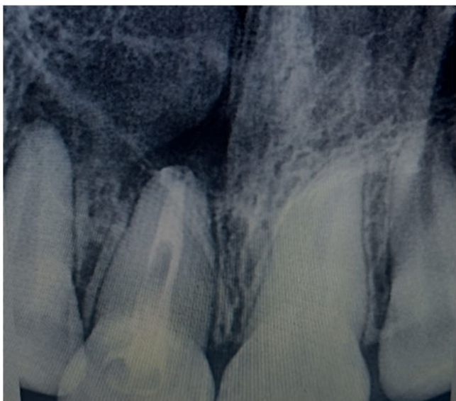
Figure 3: Intermediary restorative material cavit G and a radiograph.