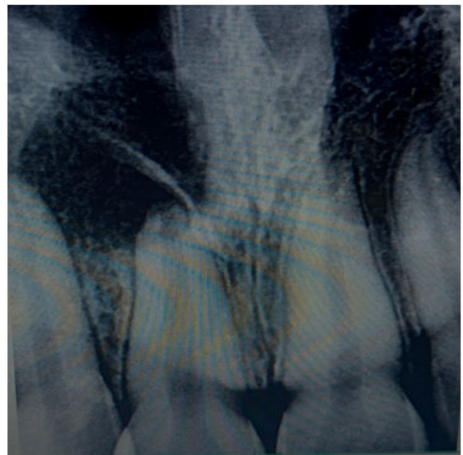
Figure 1: Periapical cyst of canine (11) in the periapical region.

A permanent core restoration was done using direct composite and the patient was recalled after two weeks for indirect permanent restoration.