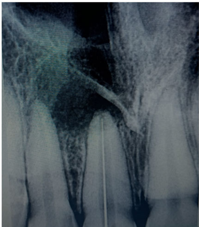
Figure 2: Estimation of canine thorough chemo-mechanical preparation.