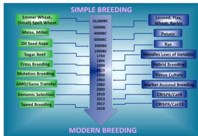
Figure 1: Historical milestones in plant breeding. For 10,000 years, farmers and breeders have been developing and improving crops.

Plant genome improvement is insufficient for developing new plant varieties using traditional breeding approaches. Since the 1990s, molecular markers have been employed to identify superior hybrid lines to overcome this barrier in plant breeding procedures. The artificial selection and breeding of this provided attribute by the plant breeder is required to improve plant phenotype for a certain desirable trait. In general, breeders focus on diploid or diploid-like qualities (maize and tomatoes) rather than polyploidy traits (alfalfa and potatoes), which have more complex genetics. Breeders prefer to use crops with shorter reproductive cycles, which allow for the production of multiple generations in a single year, resulting in faster artificial breeding of desired phenotypes than crops that reproduce only once a year or perennial plants that reproduce only once every few years (Figure 2).