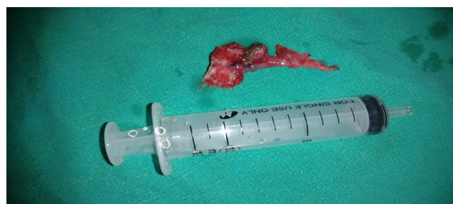
Figure 3: Specimen of thyroglossal tract with hyoid bone attached at one end and sternohyoid muscle at other end.