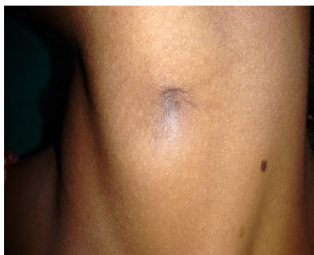
Figure 1: fistula opening in left side of neck.

embryonic life, only its original connection with base of tongue remains as the foramen caecum on the tongue. Any portion of duct it may remain resulting in (a) Thyroglossal fistula, (b) Thyroglossal sinus, (c) Thyroglossal cyst [8]. Thyroglossal cysts predominate with fewer sinus and fistula. Thyroglossal duct carcinoma is rare, estimated no more than 1% of Thyroglossal duct cyst and when it supervenes, it is usually a sub type of papillary thyroid carcinoma [9].