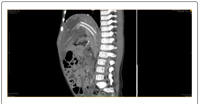
Figure 1: CT scan showing Self Expanding Metallic stent placed in the Cavoportal hemi transposition.

Protocol post-operative day (POD)-1: USG liver doppler, showed non-visualization of Hepatic vein and Portal vein, hence urgent CTLA was done which confirmed absent portal venous flow. Hence DSA and stenting of Porto-caval anastomosis was done on September 18, 2013 and portal flow was re-established.