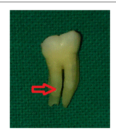
Figure 2c: Lingual view.