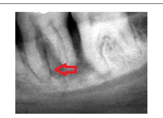
Figure 2a: IOPA X-ray 36.

located on distolingual aspect of the pulpal floor making access cavity shape from triangular form to a trapezoidal form.