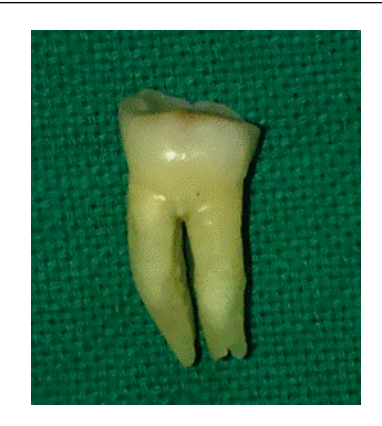
Figure 2b: Buccal view.