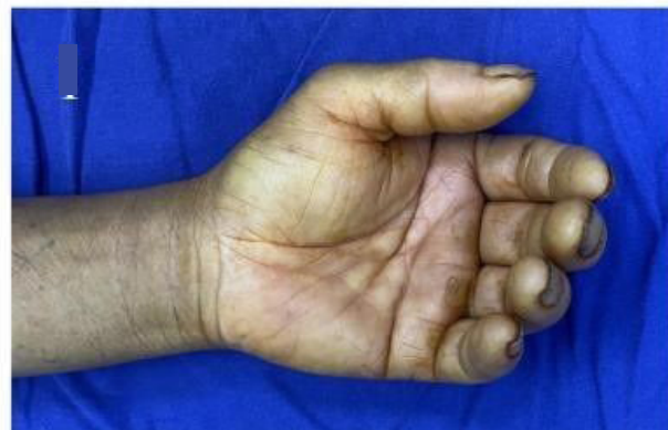
Figure 1: Before surgery, the finger flexion movement was restricted.

Physical examination showed mild swelling of the left wrist, elevated skin temperature, mild atrophy of the thenar major muscles of the left palm, tenderness over the wrist and numbness over 1-4 fingers, along with positive Tinel's sign and Phalen's test. The finger flexion movement was restricted (Figure 1). Pain score VAS: 6 points.