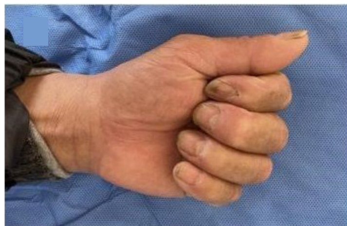
Figure 3: There was mild swelling of the wrist, and limited ability to make a fist with the fingers at the 6 weeks follow-up.