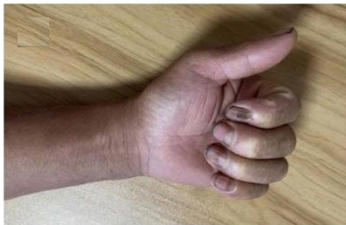
Figure 4: At the 10 month, the patient made almost full recovery of the motion range without any symptom.