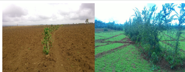
Figure 4: Sespania hedges on ridges exposed to free grazing at Gedeb Watershed (left) and Tree lucer with protected area closure at Nifasam (right).

agriculture practices for many complex reasons [12]. Major types of terraces include bench terraces, back-sloping bench terraces, stone-wall terraces and Fanya juu terraces [13].