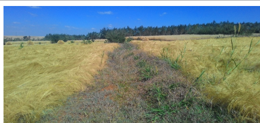
Figure 3: Level Fanayajuu in Nifasam watershed.