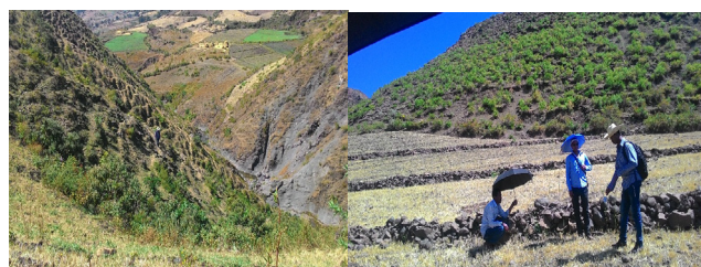
Figure 2: Partial view of terrain features in Yelam Gej Kebele (left) stone terrace at Wonabi watershed (right).