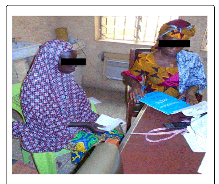
Figure 7: Registration of a female control during outreach activities in Nigeria.

process was challenging. The average member of the broader population has only basic education and does not speak English. It was therefore crucial that the CAB members were individuals who can read and write in their own language, and who can work across diverse populations, including those with both high and low literacy, and those who truly "know their community." Including representatives from faith-based groups in CABs was specifically beneficial to both the research team and the communities in addressing the research needs and agenda. We considered the CAB linkages to the community including their representation, technical expertise, leadership and cultural insight that each member brings to the CAB and to assure that most segments of the population are represented.