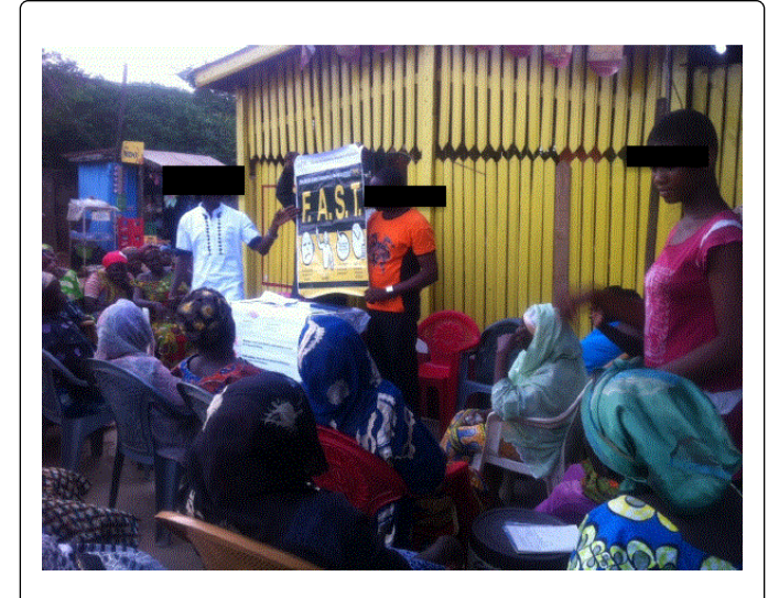
Figure 5: Stroke education among a Moslem women's group in Kumasi, Ghana.

During the CAB meetings with the CE coordinator at each SIREN site, a number of community events and social gatherings would be identified, and with the help of the CAB, the SIREN team would incorporate a community outreach in line with on-going community activities. An example of this can be emphasized from the Kumasi site in Ghana. The Muslim community in the study site held its annual celebration of Eid-ul-fitr with an audience of close to 2000 community members mainly Moslems. The CE team in Kumasi organized an educational session on stroke during the function with the aid of