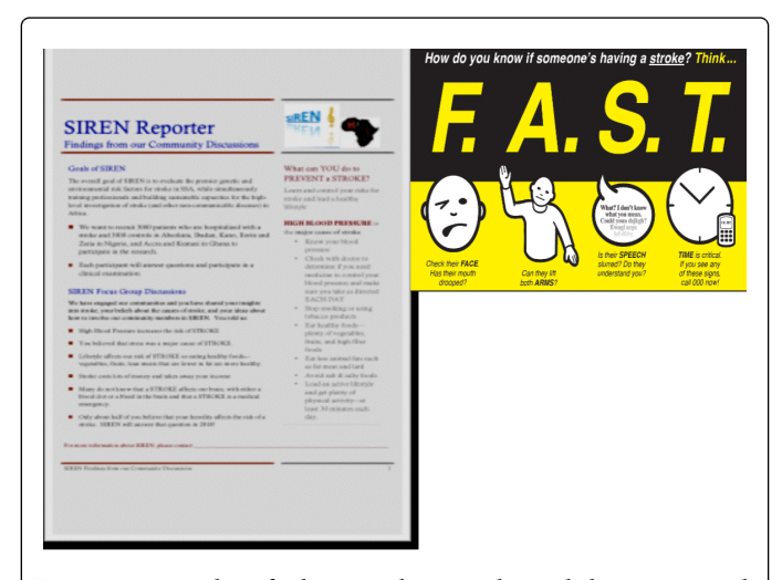
Figure 6: Examples of educational materials used during outreach activities.

Additionally in an effort to expand our reach into communities, the CE team developed a short video on stroke, newsletters (SIREN Reporter) and posters to educate community members about stroke and the results of their participation in the research (Figure 6).