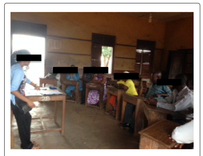
Figure 4: Focus group discussion among community members in Kumasi, Ghana.

sensitization of the community to facilitate primary prevention of stroke and addressing the condition in a timely manner. The outreach was to relevant authorities, professional organization (PO), opinion leaders, faith-based organizations (such as Churches and Mosques), community organizations in an effort to introduce SIREN, its objectives, and expectations and to invite active participation and input into SIREN (Figure 5).