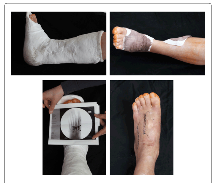
Figure 2: 2 weeks after Lisfranc-arhrodesis with TP-Augmentation. A: before cast removal; B: intra OP X-ray C: cast is removed, Sterile wound coverage still in place D: before suture removal.

A reduction in wound control doesn't raises the incidence of compartment syndrome or any kind of complication. However in case of any suspicious clinical presentation, the soft tissue condition should be checked. There always should be the possibility to slit a cast in case of prolonged pain. Thus hospitalization is recommended (Figure 2).