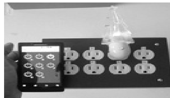
Figure 1: Phone interface and the power strip.

Extension cords or power strips most times include a main switch that allow or disallow power flow to the whole strip. This conveniently allows someone to cut off power to all the plugged-in electronic devices at once. However, other types of strips make provision for separate switches for individual outlet, making it very easy if one is interested in cutting off power supply selectively as some appliances such as computers and printers should not simply be unplugged. Doing