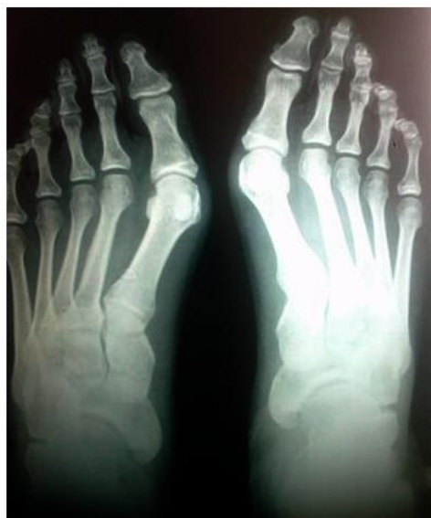
Figure 4: Postoperative (f+p) foot X-ray with hallux valgus treated with the new modified osteotomy.