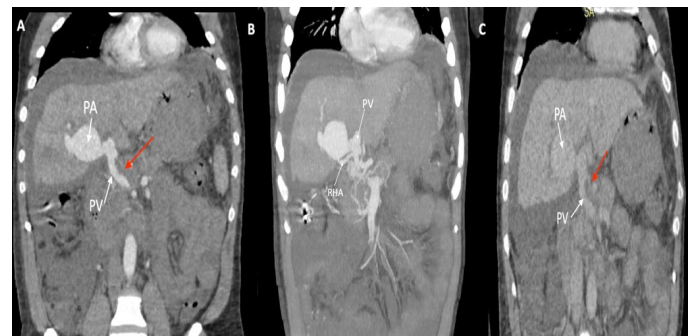
Figure 1: Sequential post-contrast coronal CT images of arterial phase (A) and (B: with maximum intensity projection MIP), image of portal phase CT (C), shows a large lobulated contrast-filled outpouching (PA) arising from the right branch of the portal vein (PV), and communicating with the right hepatic artery (RHA) suggestive of hepatic artery pseudoaneurysm with arterioportal fistula.

Treatment depends on clinical manifestations [12], monitor