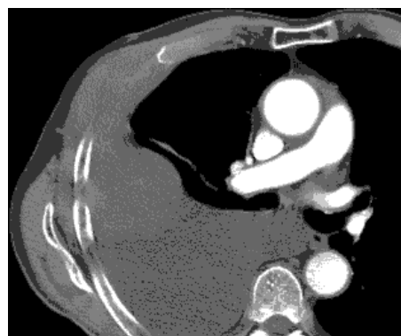
Figure 1: CT scan image showing mesothelioma eroding through the chest wall.

A 68-year-old man presented to his local hospital with severe right-sided chest pain and breathlessness. He had worked as an apprentice carpenter in the shipbuilding industry many years ago. A chest X-ray was performed which showed a right-sided pleural effusion and pleural thickening. A Computerised Tomograph (CT) (Figure 1) scan, including a CT guided biopsy, was done with pathology confirming MPM of sarcomatoid type. Treatment options were discussed with the patient. Chemotherapy was discussed but this was declined by the patient due to low likelihood of benefit. The patient agreed that treatment would be symptomatic only. The gentleman described his pain as “stabbing and shooting”, suggesting a neuropathic component. He also stated that it was severe in intensity.