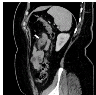
Figure 2: On coronal views, CT demonstrated better the focal out-pouching on the mesenteric side of the jejunum (arrow).

The focal inflammatory process was better demonstrated in the coronal views (Figure 2).