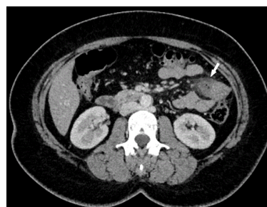
Figure 1: Abdominal CT showed on axial views asymmetric jejunal wall thickening most prominent on the mesenteric side of the bowel, containing extraluminal air with edema of the surrounding tissues (arrow).

The abdominal ultrasound was normal. Abdominal CT with multiplanar reconstructions showed on axial views a focal area of asymmetric jejunal wall thickening most prominent on the mesenteric side of the bowel, containing extraluminal air with edema of the surrounding tissues (Figure 1).