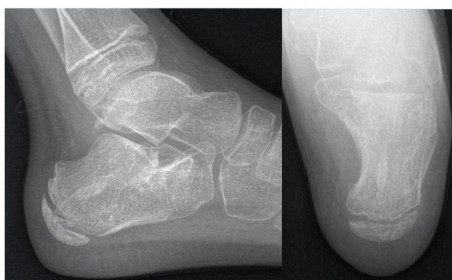
Figure 3: Simple radiography after more than 12 months of follow-up.