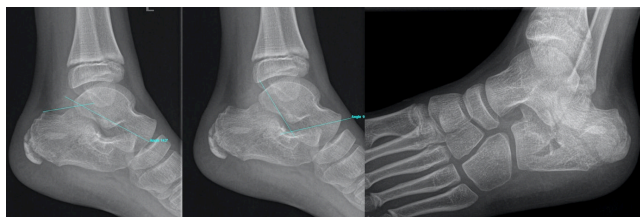
Figure 1: Simple radiograph showing the intra-articular fracture of the calcaneus with Böhler angle of 40° and Gissane angle of 109°, type 5B of the classification of pediatric calcaneal fractures (compression fracture of the subtalar joint with joint depression).