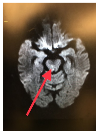
Figure 5: CT brain showing left medial longitudinal fasciculus infarction.

Our patient had binocular diplopia, defined as “diplopia (that) resolves when the affected eye is occluded”, which indicates misalignment of the visual axes as being the cause of the diplopia. In contrast, monocular diplopia, defined as “diplopia (that) persists when the affected eye is occluded” is usually caused by ophthalmological pathology, such as refractive error [2]. The binocular diplopia in our patient limited the differential diagnosis to impaired neural control or function of the extraocular muscles. Thus it is extremely important to do a careful eye exam. The most likely differentials for her included sudden onset partial oculomotor neuropathy secondary to uncontrolled diabetes mellitus and a brainstem stroke. However, in view of her NIHSS being just 1, there was a good chance of missing the stroke based on preliminary screening. It is also useful to remember that cranial nerve involvements can help localize the site of lesion and detect incipient strokes.