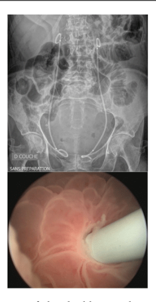
Figure 1: Appearance of the double-pigtail stents on X ray and appearance of the inflamed ureteral meatus around the double-pigtail stent [2,3].

International scientific medical studies estimate that 80% of patients complain of different symptoms [1]: incontinence, urinary frequency, urgency, dysuria, hematuria, pelvic and lumbar pain. The symptoms are largely due to bladder irritation caused by the stent and by reflux during bladder voiding (Figure 1).