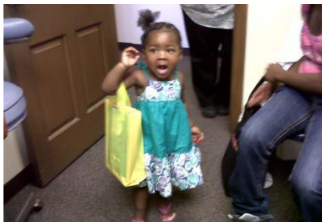
Figure 2: First child seen at one of the WIC sites leaving with her yellow goodie bag.

The immediate target area was two counties, an urban county and a rural county, in Ohio. Thereafter, depending on the success of the project, the target area is the entire state of Ohio, and if possible, those WIC sites in the United States which do not have a fluoride program. Expanding this intervention to other locations is voluntary on the part of WIC. For this pilot demonstration project, two WIC locations have