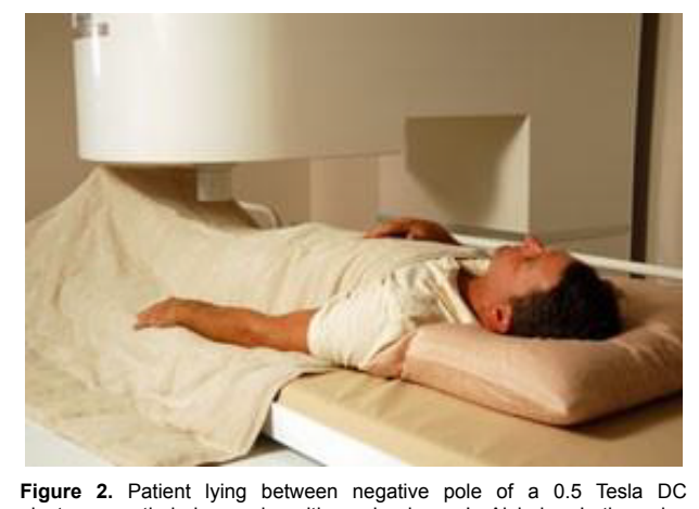
Figure 2. Patient lying between negative pole of a 0.5 Tesla DC electromagnetic below and positive pole above. In Alzheimer's the poles would be below and above the patient's head.

When the patient was treated with the device there is a temporary increase in the magnetic force on the atoms of the body resulting in a higher velocity and precession of certain orbiting electrons resulting in enhanced electron transfer and chemical reactions. Alzheimer's disease (AD) is a neurodegenerative disease secondary to oxidative stress, associated with genetic and environmental factors such as exposure to pesticides and heavy metals with subsequent depletion of mitochondrial protective enzymes, superoxide dismutase and glutathione via free radical toxicity. Seven AD patients were treated with DC EMF from 12 to 330 hours under an IRB approved protocol. Results: All seven AD patients after magnetic therapy improved in cognition and memory. However, the previous enhanced cognition deteriorated after 6 months of completing the DC EMF therapy in most patients. Discussion: was hypothesized to up-regulate superoxide dismutase and glutathione and eliminate heavy metals. It may even drive Borrelia Bb(Lyme disease) due to its strong negative electrostatic charge from the tissues and upregulate endogenous stem cells. In order to have sustained improvement in Alzheimer patients suspected of having ongoing bacterial infection with Borrelia, long term antibiotic therapy (2 months) was proposed for those testing positive for Borrelia Bd. instituted along with 200 hours of DC EMF therapy [58].