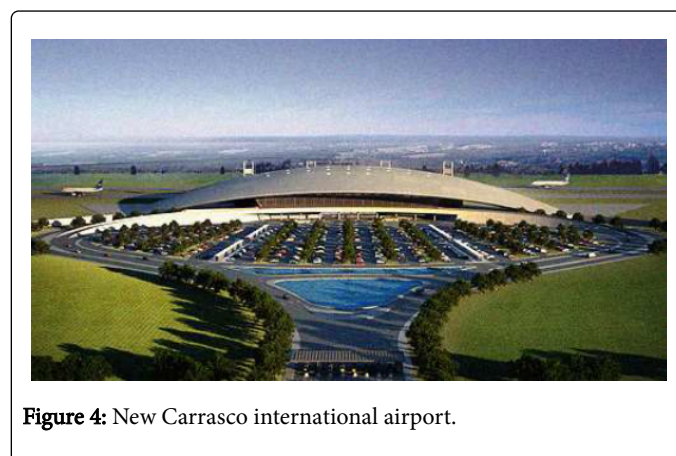
Figure 4: New Carrasco international airport.

The government has always influenced the way cities develop and expand. At the same time, states normally accumulate enough tax money to finance large buildings, and thus it is the state that builds airports, libraries and, in some cases, stadiums. When these factors are combined, city planners can create a specialized and organized area, such as residential or industrial zones, from the ground up or shift the axis of commercial districts, resulting in better city planning. The advantage of organizing the city with a plan in mind as opposed to allowing completely organic growth are that infrastructure can be put in place without having to buy private land, such as in the case of widening of roads, and that more efficient markets can be created by grouping industries together into clusters. The new Carrasco international airport was built at a time when Uruguay was growing. By 2010, the Uruguayan GDP had been increasing significantly for seven years. In a country where the most important value is humility, whose president used to have the lowest salary in the world, a development like the airport was quite shocking (Figure 4).