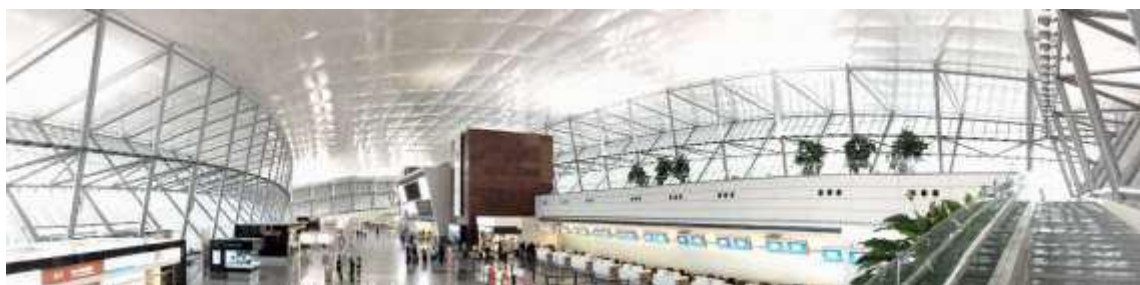
Figure 2: Dome-like ceiling airport.

Prefab horizontal systems are any piece to be placed parallel to the ground that was built or manufactured previously to their application in a building, such as floating floors. The tiles that constitute the airport's dome-like ceiling belong in this categorization 11 (Figure 2).