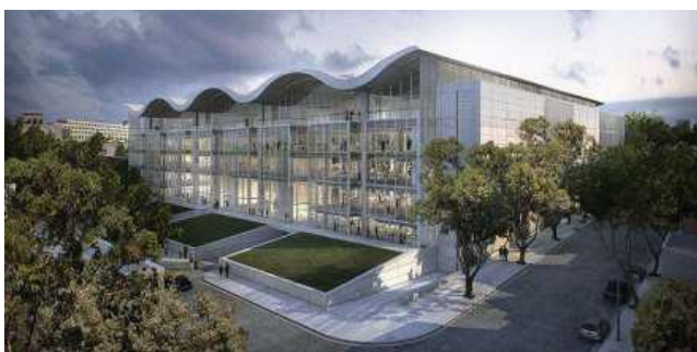
Figure 5: New mayor's office in Buenos Aires.

Architects who are commissioned buildings overseas often look for interesting characteristics in the architecture of the region and combine them with their personal style. They do their best to avoid making their building look like it is out of place, or alien to the culture. A building usually and traditionally needs to merge seamlessly with its surroundings. Hi-tech has seemed to break with that tradition. The movement's natural habitat is London, where it was born. But as it expanded throughout the world, more and more cities started to receive direct transplants [13]. The new mayor's office in Buenos Aires was built by Norman Foster, the world's most famous contemporary architect, who transplanted his British style and brought it to South America. Unlike his only previous work in the city, where he remodeled a classic port area barn while maintaining its brick exterior and windows details, the new government building looks like it could have been built anywhere in the world. Similarly to the image the airport wants to convey in Uruguay, this landmark building in the neighborhood of Parque Patricios, BA wants to transform the area into a thrilling technological district, where foreign businesses and investors want to belong (Figure 5).