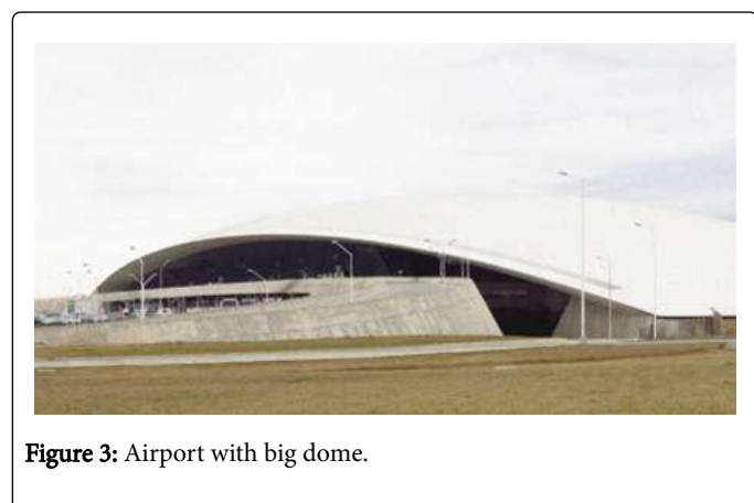
Figure 3: Airport with big dome.

As mentioned before, form dominates late modernism. The Carrasco airport's single most important feature is its dome-like shape, Norman Foster's Gherkin was carefully designed to look like a cucumber 16 . According to Adrian Forty, Professor of Architectural history at University College of London, "(...) almost nowhere except within the world of German philosophical aesthetics was 'form' used in architecture in any other sense than to mean simply 'shape' or 'mass' 17 , 18 . The airport's form, comprised of a big dome is a clear sign that form was prioritized over function. Even though the airport has room for expansions, as Montevideo grows, a higher traffic of flights will demand for new terminals to be built. Because of this particular design, the construction of these buildings will have to be alongside, not connected; resulting in larger costs (Figure 3).