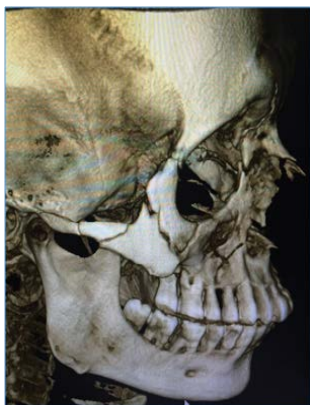
Figure 8: CBCT-3D-Reconstruction lateral view showing right zygomaticomaxillary complex fracture.