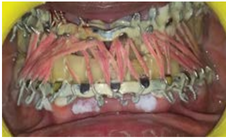
Figure 14: Postoperative day 15 showing anterior cross bite.