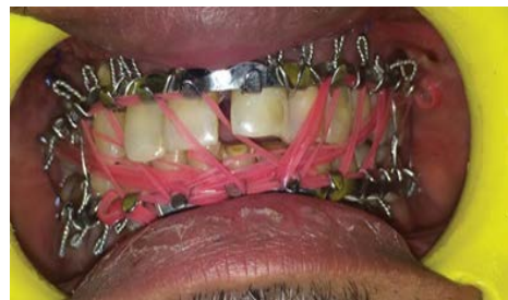
Figure 12: Post-operative occlusion with guiding elastics.