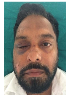
Figure 1: Extra-oral examination showing facial asymmetry with right periorbital edema and ecchymosis.

CBCT showed fracture of lateral orbital wall, infraorbital rim, lateral