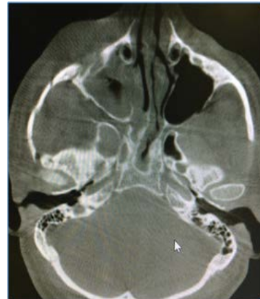
Figure 4: CBCT-Axial section showing fracture of right zygomatic arch and anterior wall of maxillary sinus with haemosinus.

As a rule, early reduction of a Lefort I fractures presents minimal