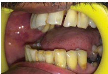
Figure 3: Intra-oral examination showing ecchymosis in right buccal mucosa extending to maxillary vestibular region.

wall of maxillary sinus, opacification of maxillary sinus on right side. Panoramic reconstruction showed fracture of floor of sinus extending interdental till the alveolar crest between 14 and 15 (Figures 4-8).