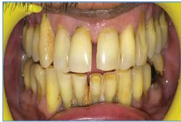
Figure 2: Intra-oral examination showing deranged occlusion with edge-to-edge bite.