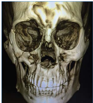
Figure 7: CBCT-3D-Reconstruction frontal view showing Le-Fort I maxillary and right zygomaticomaxillary complex fracture.