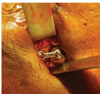
Figure 9: Right Fronto-zygomatic region fixed with one plate of 2 hole with gap.

difficulty. Beyond 7-10 days, increasing force has to be applied to complete reduction. A minimally displaced fracture is reduced and immobilized ideally by open reduction and immobilization carried out by appropriate plating devices. Alternatively and less ideally, 4 weeks of intermaxillary fixation is usually sufficient for healing to occur. In case of severe comminution, it may be necessary to extend the period to 6 weeks. An impacted fracture or one not easily reduced because of early fibrous union should be reduced by the use of either Rowe or Hayton-Williams disimpaction forceps. Two point fixation is minimal requirement for stability in case of unilateral Lefort I fracture [5].