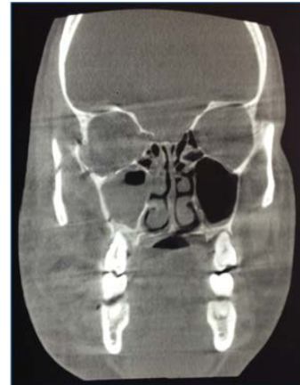
Figure 5: CBCT-Coronal section showing right fronto-zygomatic fracture with intact orbital floor.