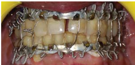
Figure 15: Guiding elastics removed and rigid MMF done with 26 gauge wire.

with open reduction and internal fixation of at least two of its four major processes [6].