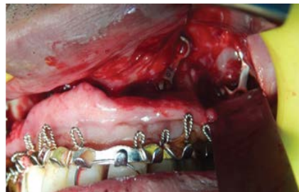
Figure 10: Left undisplaced Lefort I fracture line fixed with two plates.

The fact that so many techniques are available for reduction and fixation of zygomaticomaxillary complex (ZMC) fractures indicates that no one technique is always superior to others. It is not so much the actual technique, but the proper application of principles produces satisfactory results. Each ZMC fractures should be treated aggressively