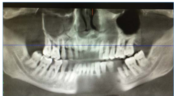
Figure 6: CBCT-Panoramic Reconstruction showing fracture line running between 1st and 2nd premolars.