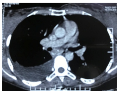
Figure 3: CT scan: right pleural effusion.

Computerized tomography of thorax (Figure 3) was also consistent with right side pleural effusion without any parenchymal lesion. Pleural aspiration from right side yielded turbid yellow fluid. Cytochemical examination revealed exudative fluid, high cell counts with polymorph nuclear predominance and low ADA. Injectable antibiotics were given suspecting empyema as she was running fever (ranging 101-103 F). Culture of pleural fluid yielded no growth.