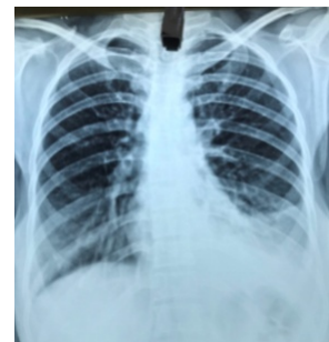
Figure 1: Chest x-ray: left pleural effusion.

Patient was under treatment of her family physician. She was taking anti tubercular treatment (ATT) for last 10 days for left side pleural effusion detected on chest X-ray (Figure 1) and confirmed by ultrasound thorax. As per records, pleural fluid aspirated before starting ATT was exudate, lymphocytic predominant and with high adenosine deaminase (ADA) level.