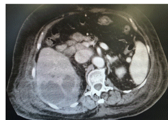
Figure 2: Liver abscess in enhanced abdominal CT.