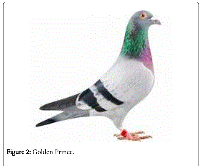
Figure 2: Golden Prince.