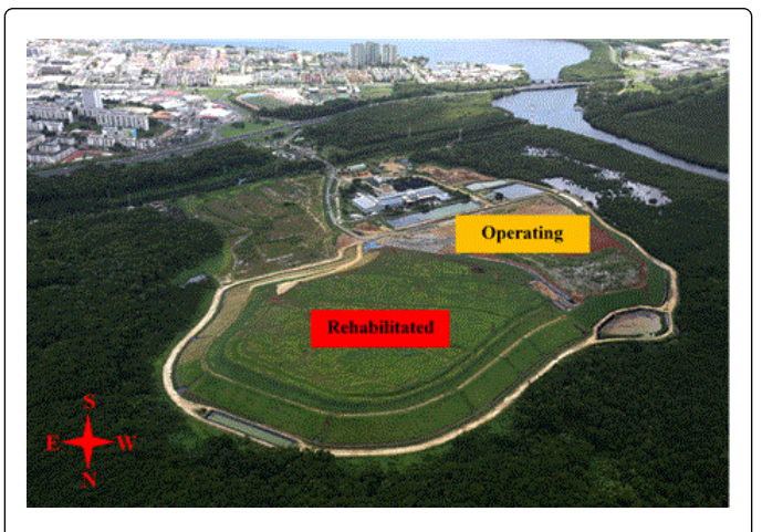
Figure 1: Aerial view of the study site with the landfill at the center between the mangrove swamp to the north and urban areas to the south

The rehabilitated waste dome has reached at the end of its operation an area of 12 ha and a height of 24 m. This part has been operated from mid-90 to the end of January 2013. About 2,000,000 tons of waste were stored in this area. The waste in the dome was principally composed of household waste (~52%), bulky refuse (~20%), green waste (~11%) and packaging (such as plastic, wood, carton, etc.) (~10%). Before the beginning of the rehabilitation in December 2010, there was no system to collect and process the biogas and leachate.