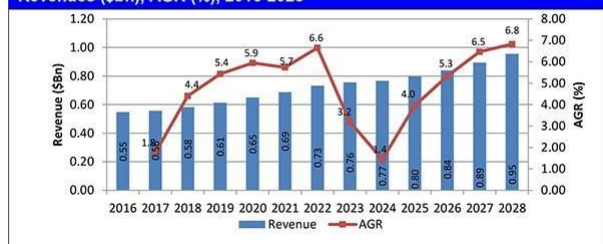
Figure 13.7 Rest of MEA Dermatological Drugs Market Forecast: Revenues ($bn), AGR (%), 2016-2028

This report surveys the accessible remedial strategies for skin, alongside the medications and advancements as of now being utilized for different skin medicines. The job of open organizations, the administrative condition, and non-legislative partners has likewise been inspected.