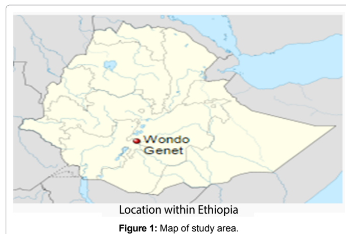
Location within Ethiopia Figure 1: Map of study area.

Aboveground biomass estimation: Above-ground biomass comprises all woody stems, branches, and leaves of living trees, creepers,