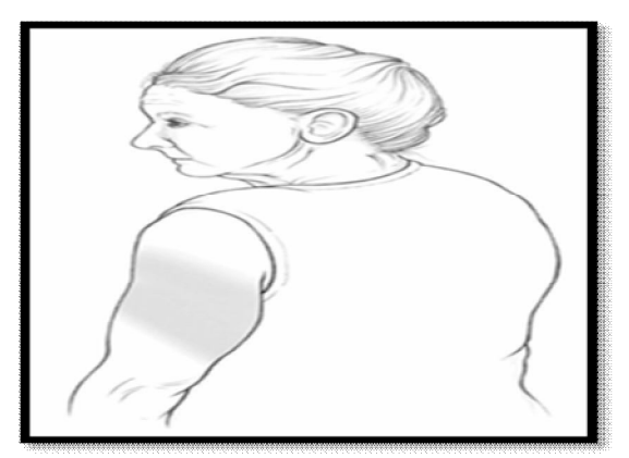
Figure no 2. Subcutaneous route

Subcutaneous injections are administered into the fatty tissue found below the dermis and above muscle tissue. It is that recommended subcutaneous sites for vaccine administration are the thigh (for infants younger than 12 months of age) and the upper outer triceps of the arm (for persons 12 months of age and older). If necessary, the upper outer triceps area can be used to administer subcutaneous injections to infants. Needle Gauge & Length - 5/8-inch, 23to 25-gauge needle.