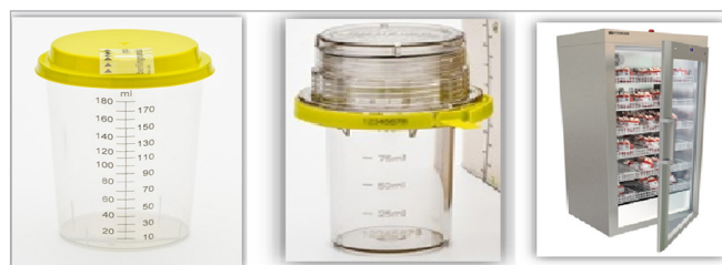
Figure (2): Adulteration detection container, RFID container and RFID smart fridge