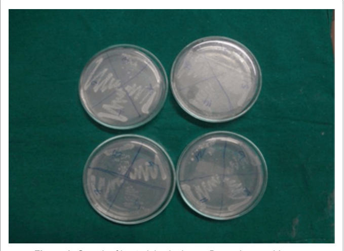
Figure 1: Growth of bacterial colonies on Brewer's anerobic agar.

The samples were also inoculated aerobically on blood agar (M001) (Figure 2) supplied by Hi media laboratories, Mumbai. The colonies