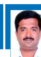
CT Sreeramareddy Melaka-Manipal Medical College Malaysia