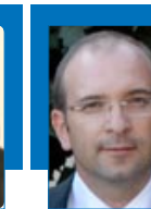
Jerome Roncalli Rangueil University Hospital, France