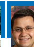
Zaher Merhi Montefiore Reproductive Center, USA